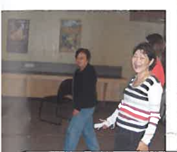
Seniors playing Wii at the Seniors Resource fair, Building Blocks at Cardel Place.