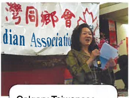
Calgary Taiwanese Canadian Association Chinese New Year Banquet.